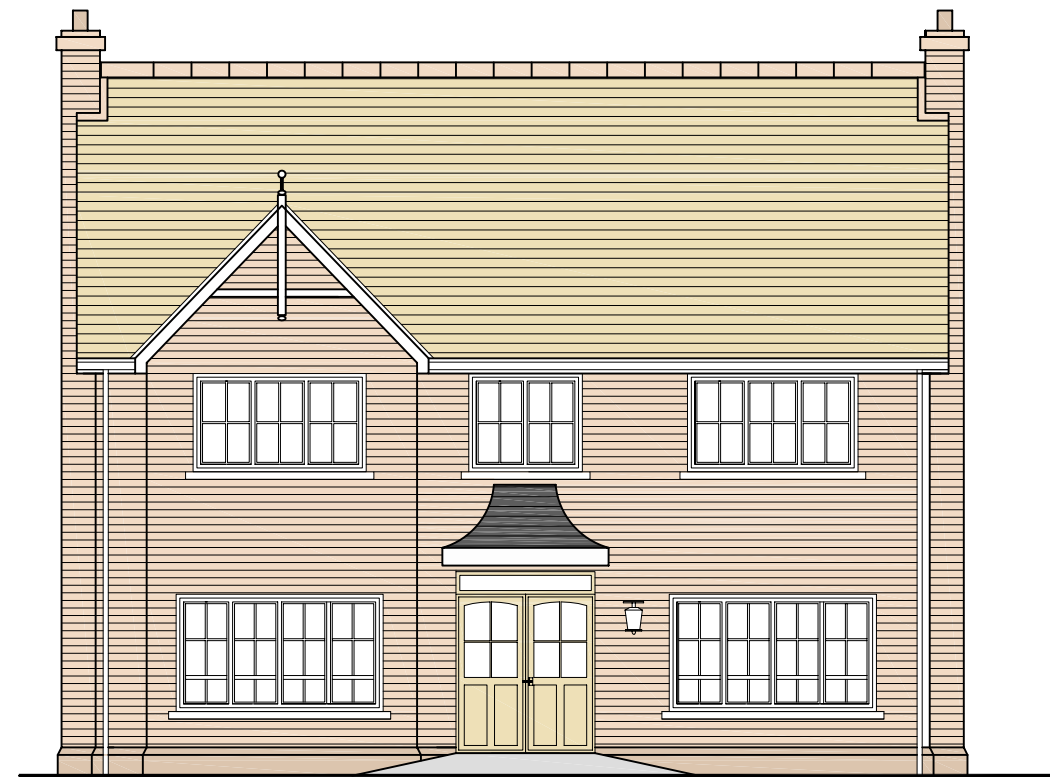
Front elevation 1:100